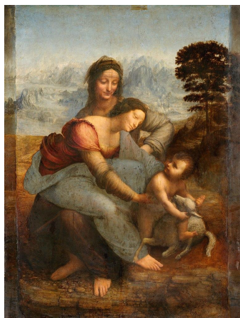
Leonardo da Vinci, The Virgin and Child with Saint Anne , 1501-1519, oil on wood, Louvre, Paris

After that a lot of artists started to represent mountains and nature and to travel to see these beauties. But art is always in development, so who knows how the view of mountains could change once more.