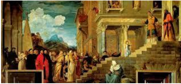
Titian, The Presentation of the Virgin at the Temple , 1534–1538, Gallery of the Academy of Florence